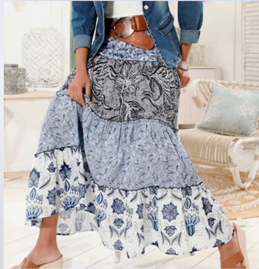
FMG-MAR24-476 COTTON CAMBRIC