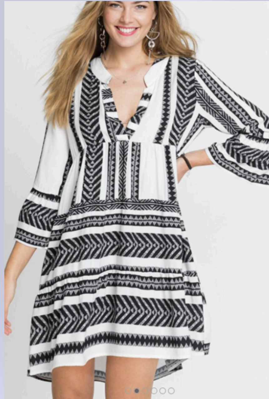
FMG-MAR24-430 30S VISCOSE