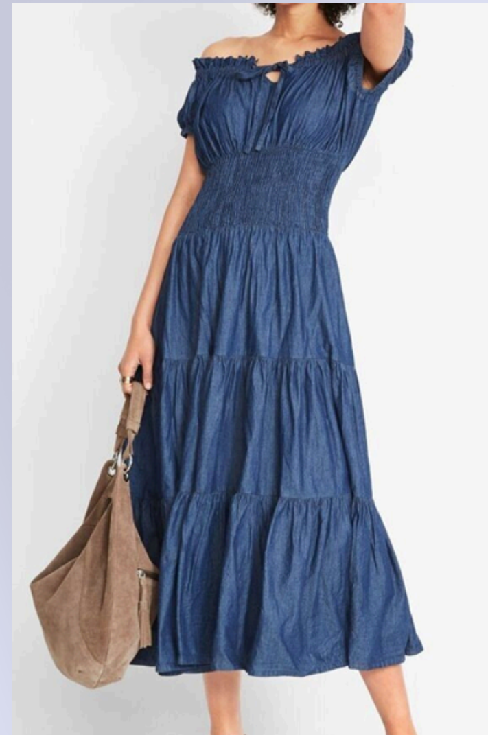
FMG-MAR24-438 COTTON DENIM