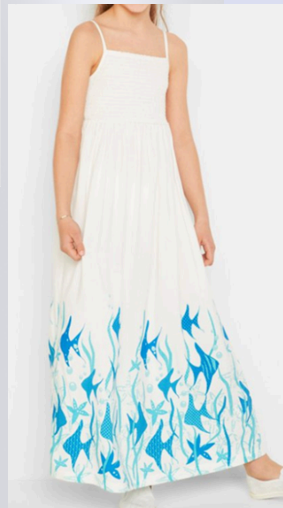
FMG-JUL23-14 COTTON CAMBRIC