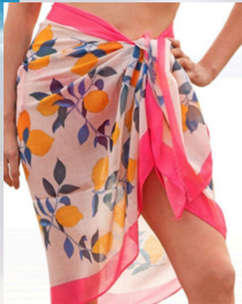
FMG-MAR24-733 COTTON VOILE