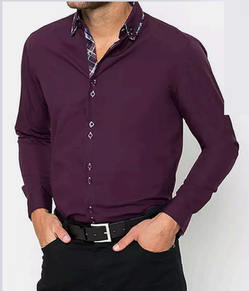
FMG-MAR24-1400 COTTON POPLIN