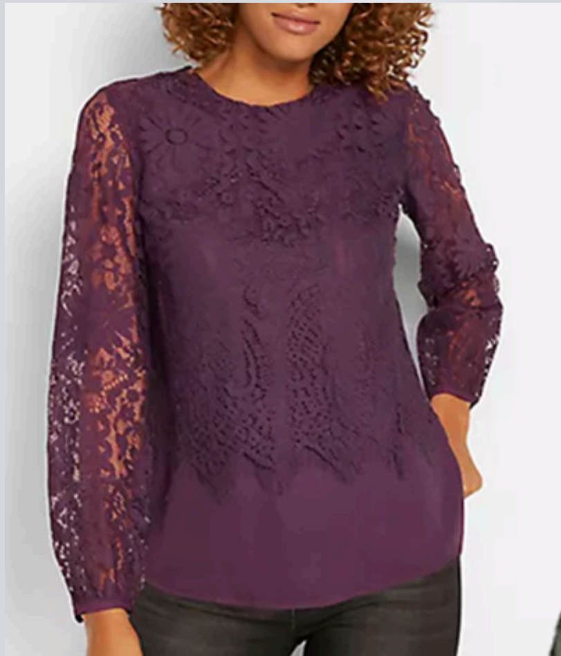
FMG-MAR24-414 POLY GEORGETTE