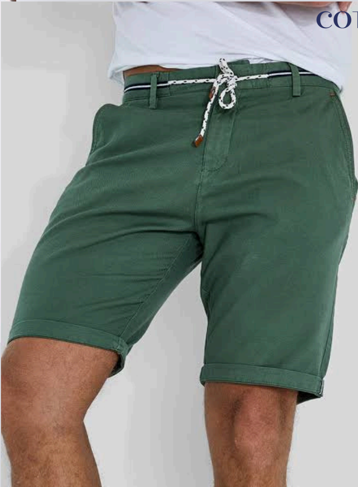
FMG-MAR24-74313 COTTON LYCRA