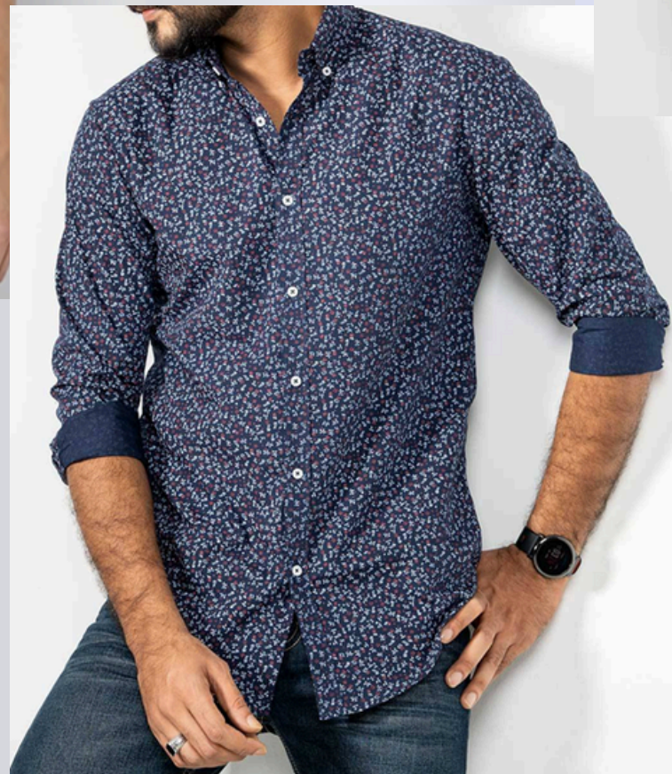
FMG-MAR24-1406 COTTON POPLIN