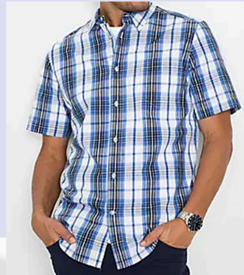
FMG-MAR24-1412 COTTON YARN DYED