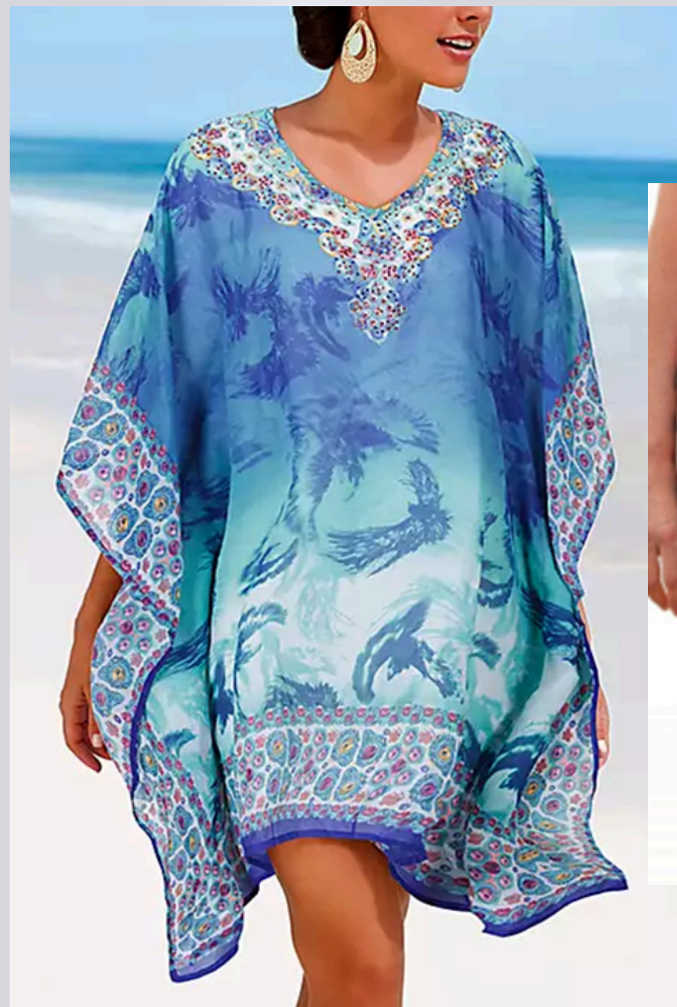
FMG-66733041 POLY VOILE