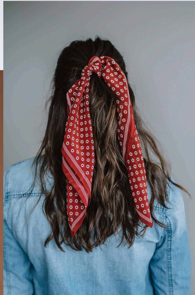
FMG-MAR24-7425 POLY CREPE