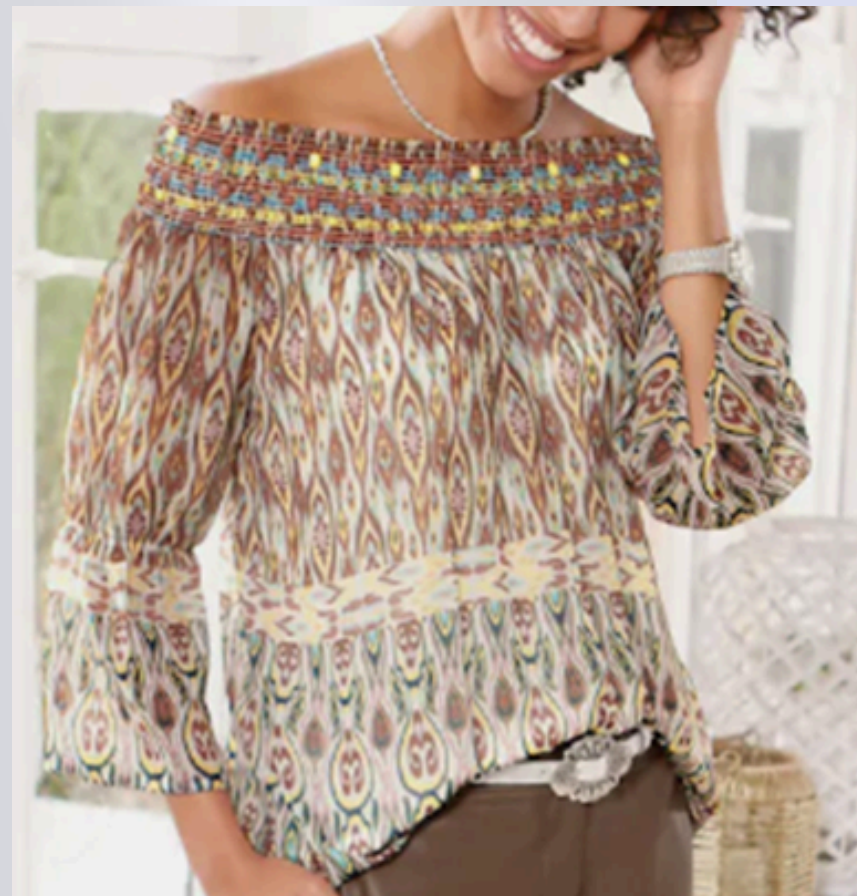
FMG-MAR24-404 POLY GEORGETTE