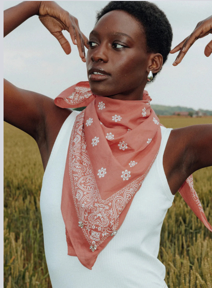
FMG-MAR24-7299 POLY VOILE