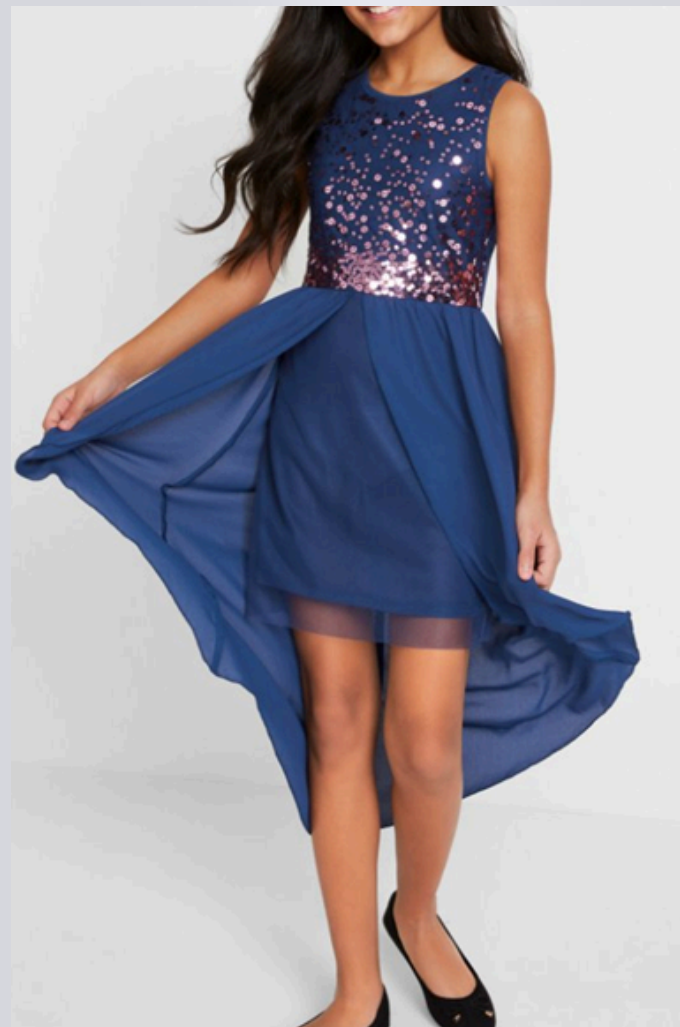
FMG-JUL23-01 POLY GEORGETTE + SEQUENS