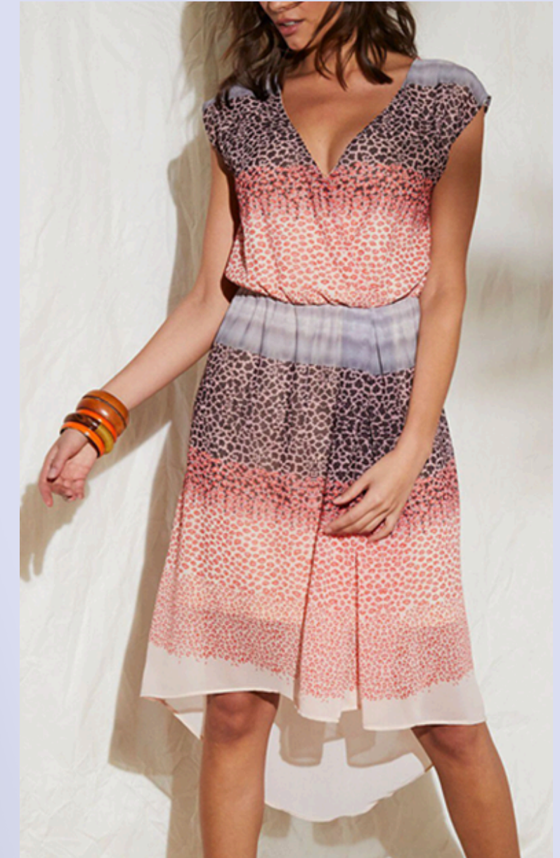
FMG-MAR24-440 POLY GEORGETTE