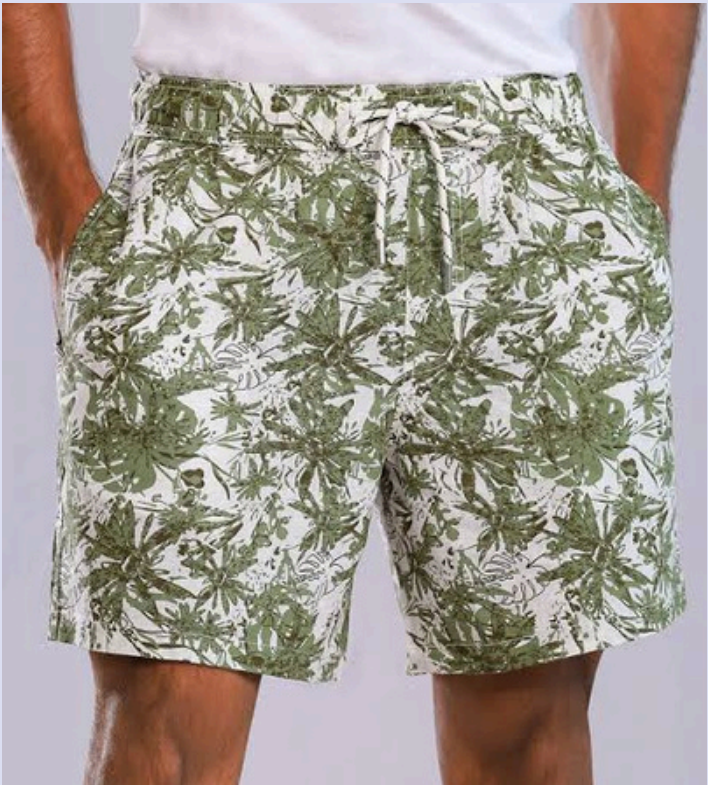
FMG-MAR23-9608 COTTON CAMBRIC