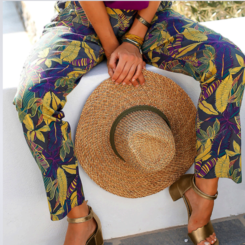
FMG-MAR24-456 30S VISCOSE