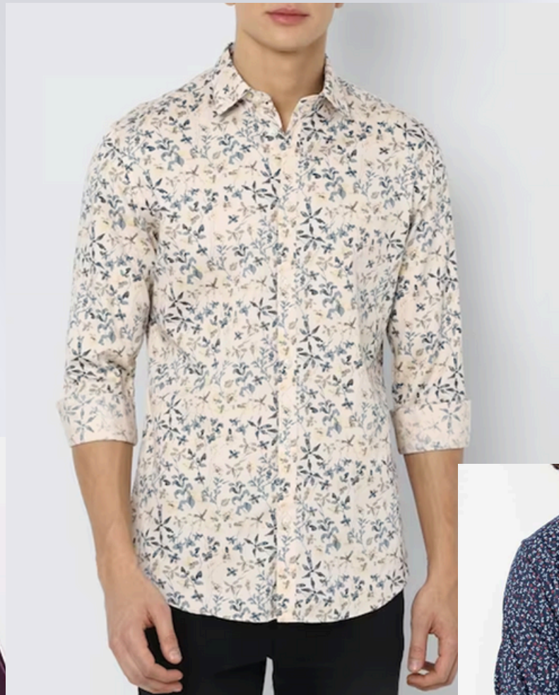
FMG-MAR24-1402 COTTON CAMBRIC