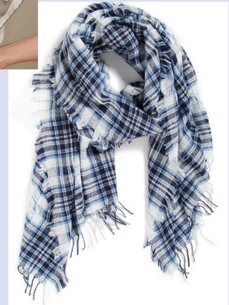
FMG-MAR23-9601 COTTON YARN DYED