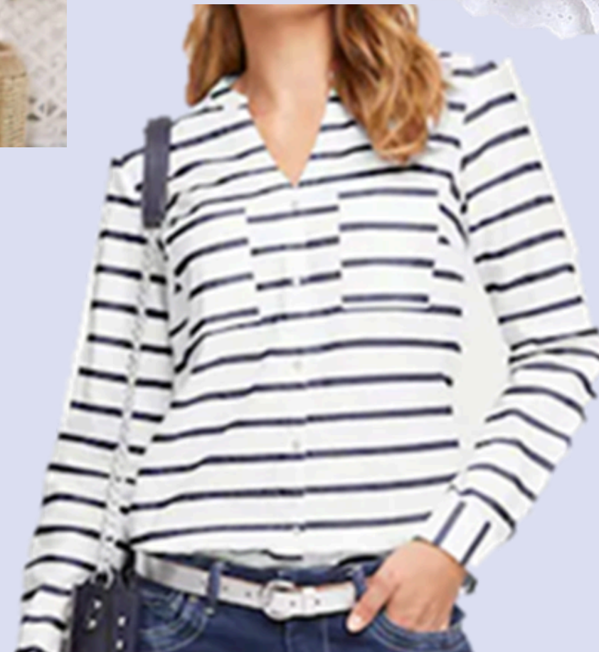
FMG-MAR24-AC376PAF-C COTTON LINEN