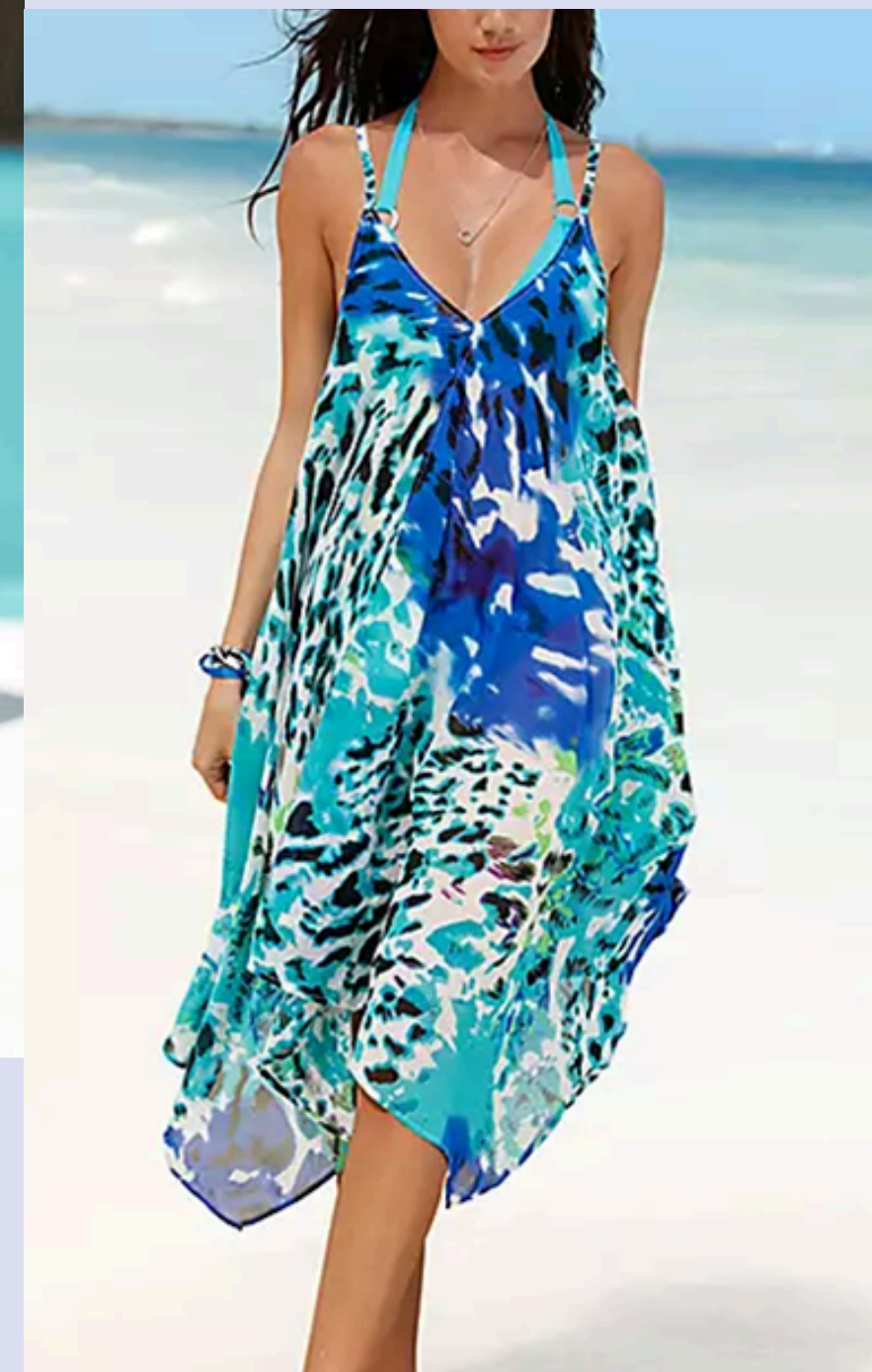
STYLE NO - FMG-MAR23-601 POLY VOILE