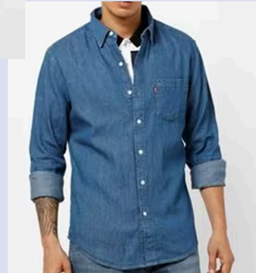
FMG-MAR24-1409 COTTON DENIM