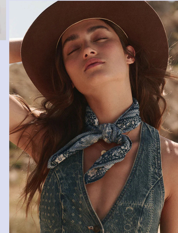
FMG-MAR24-7441 30s VISCOSE