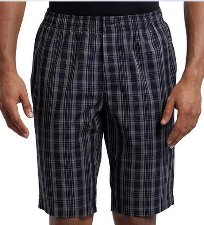
FMG-MAR24-7335 COTTON YARN DYED