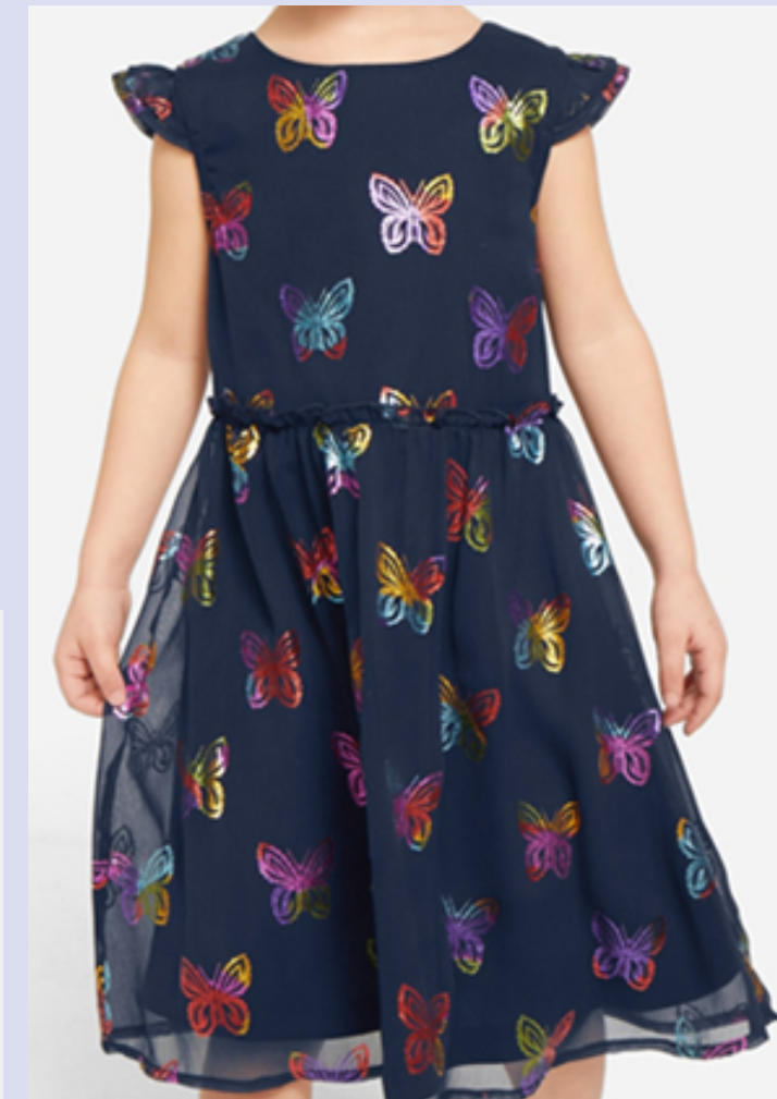
FMG-JUL23-12 POLY CHIFFON+FOIL PRINT