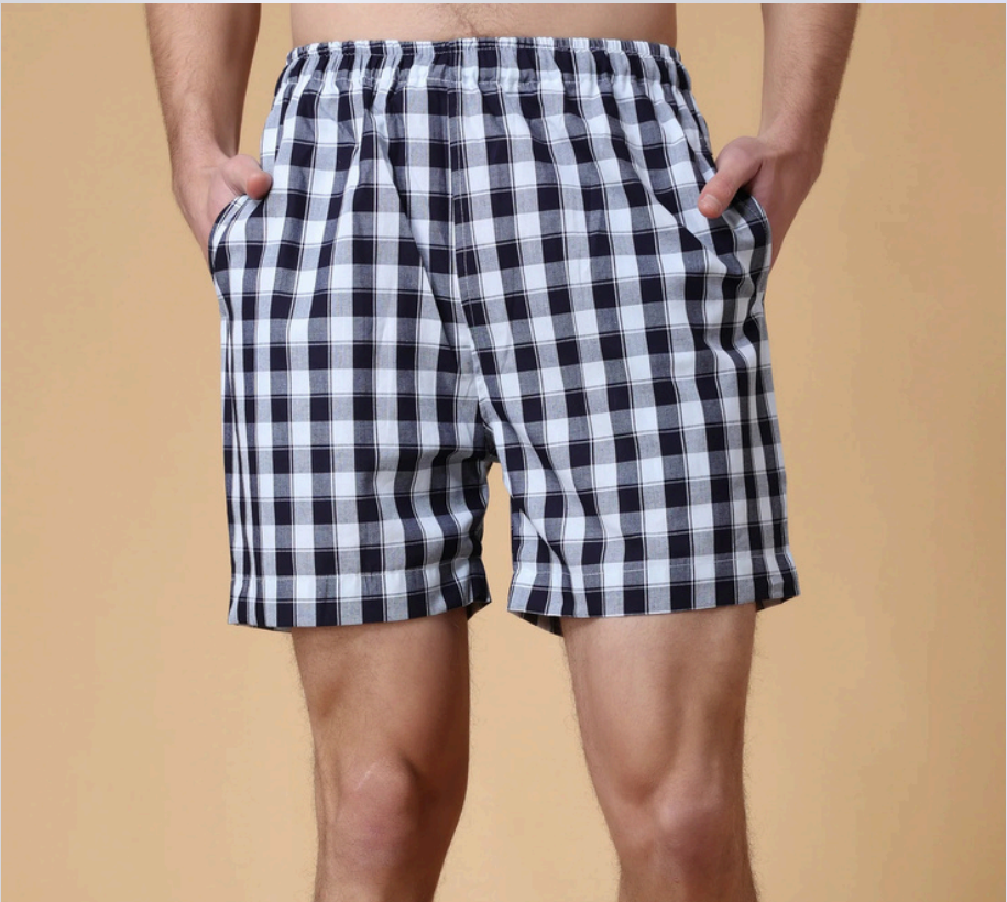
FMG-APR24-7863 COTTON YARN DYED