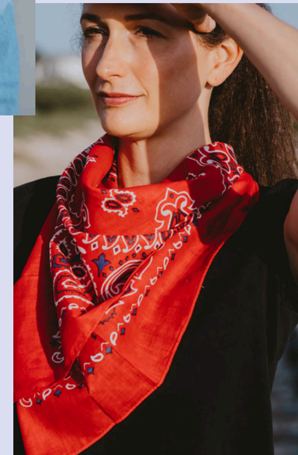
FMG-MAR24-7143 COTTON CAMBRIC