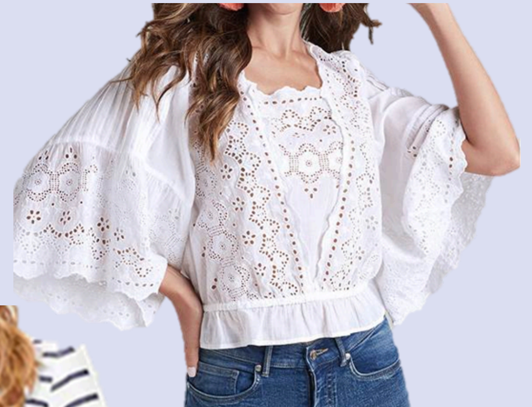
FMG-MAR24-1236 COTTON CAMBRIC