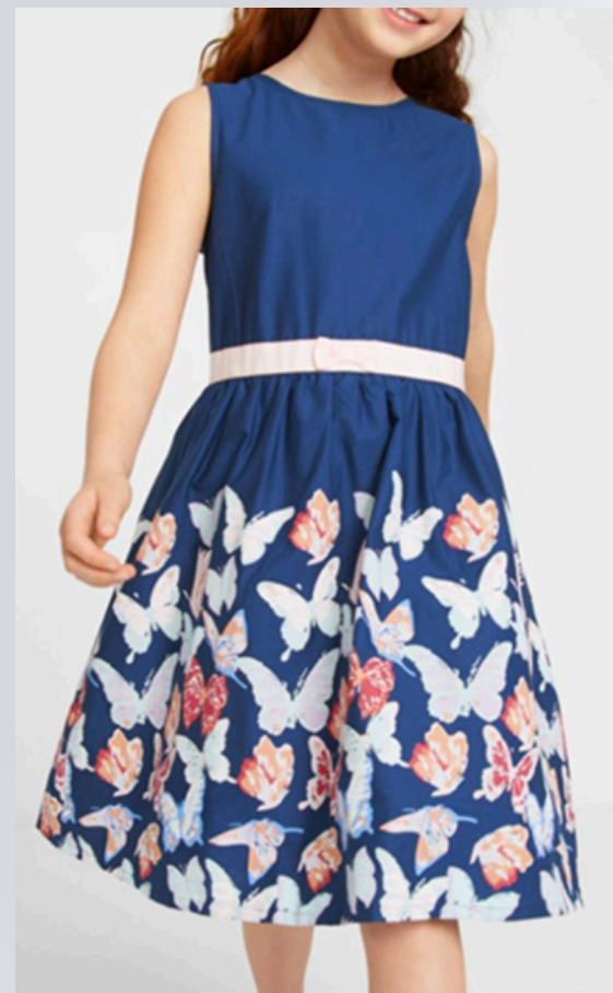
FMG-JUL23-07 COTTON POPLIN