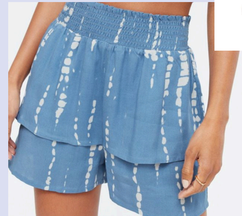
STYLE NO - FMG-MAR23-563 30S VISCOSE