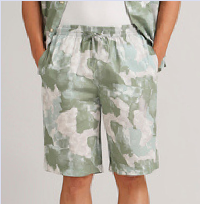
FMG-NOV2024-2453 COTTON CAMBRIC