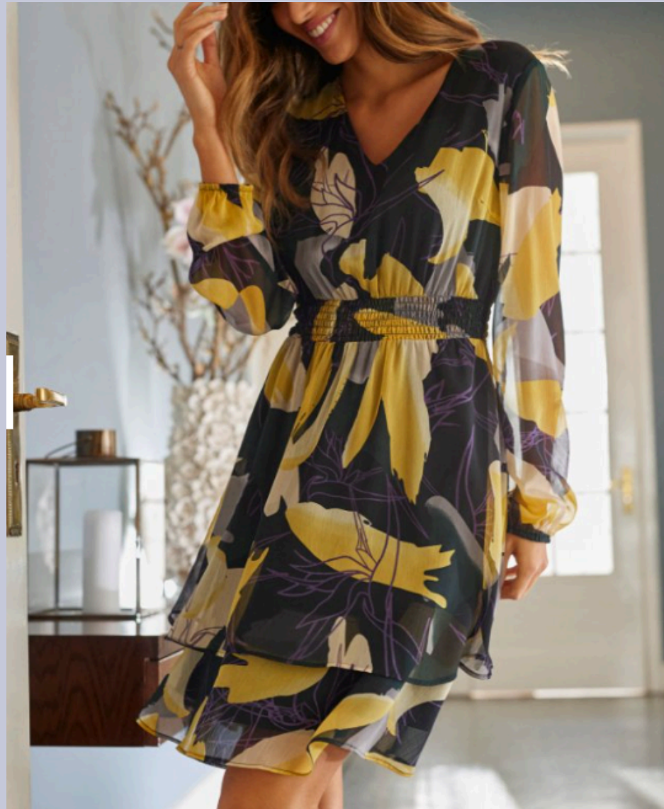
FMG-MAR24-1238 POLY GEORGETTE