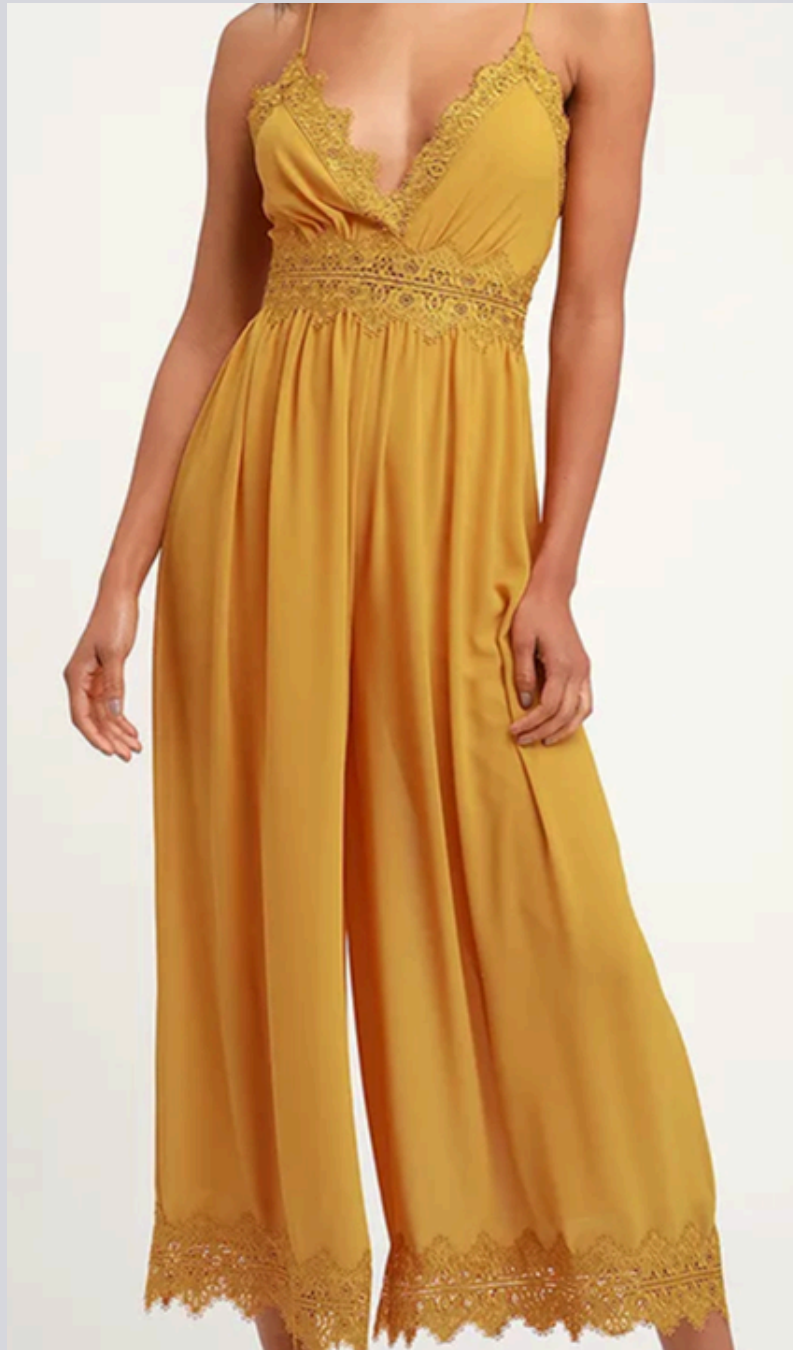
FMG-MAR24-441 POLY GEORGETTE