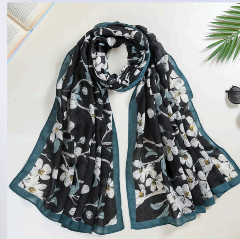
FMG-MAR24-733 COTTON VOILE