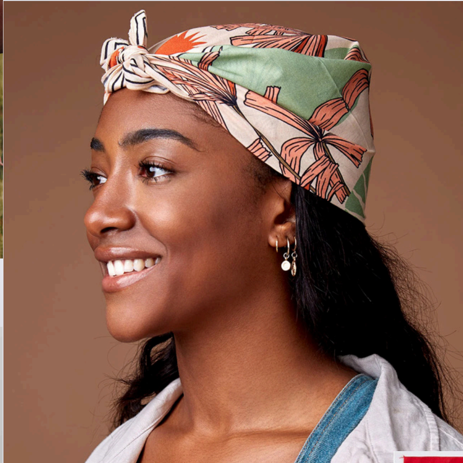
FMG-MAR24-7351 COTTON CAMBRIC