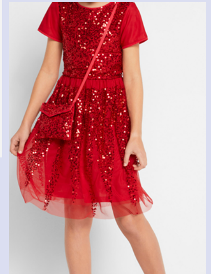
FMG-JUL23-09 (MATCHING BAG) POLY MESH