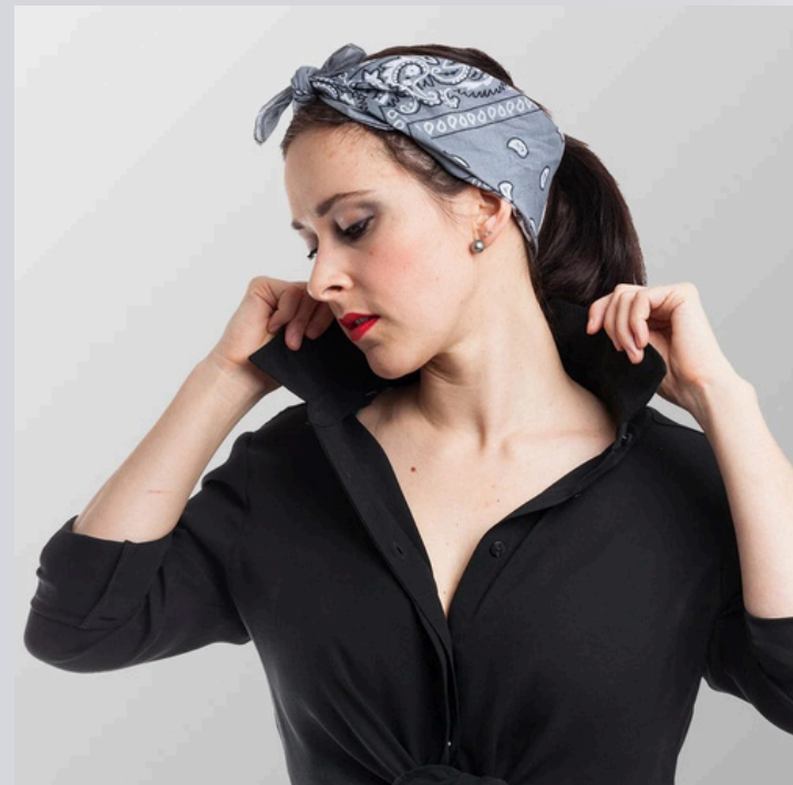
FMG-MAR24-7301 COTTON CAMBRIC